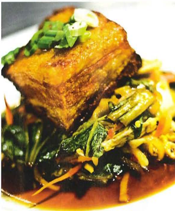
A few of 10 Below's delectable dishes (clockwise from top left): Roasted Northwest Salmon, Tahitian Vanilla Crème Brulee, Tartare Flight and Korean BBQ Pork Belly.