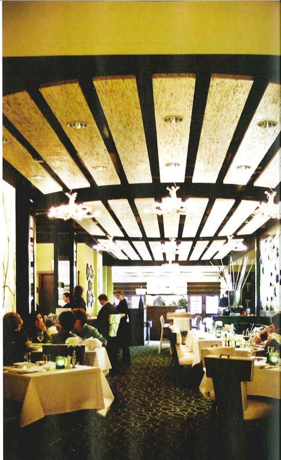
10 Below's interior is dominated by geometric shapes and unique accessories.