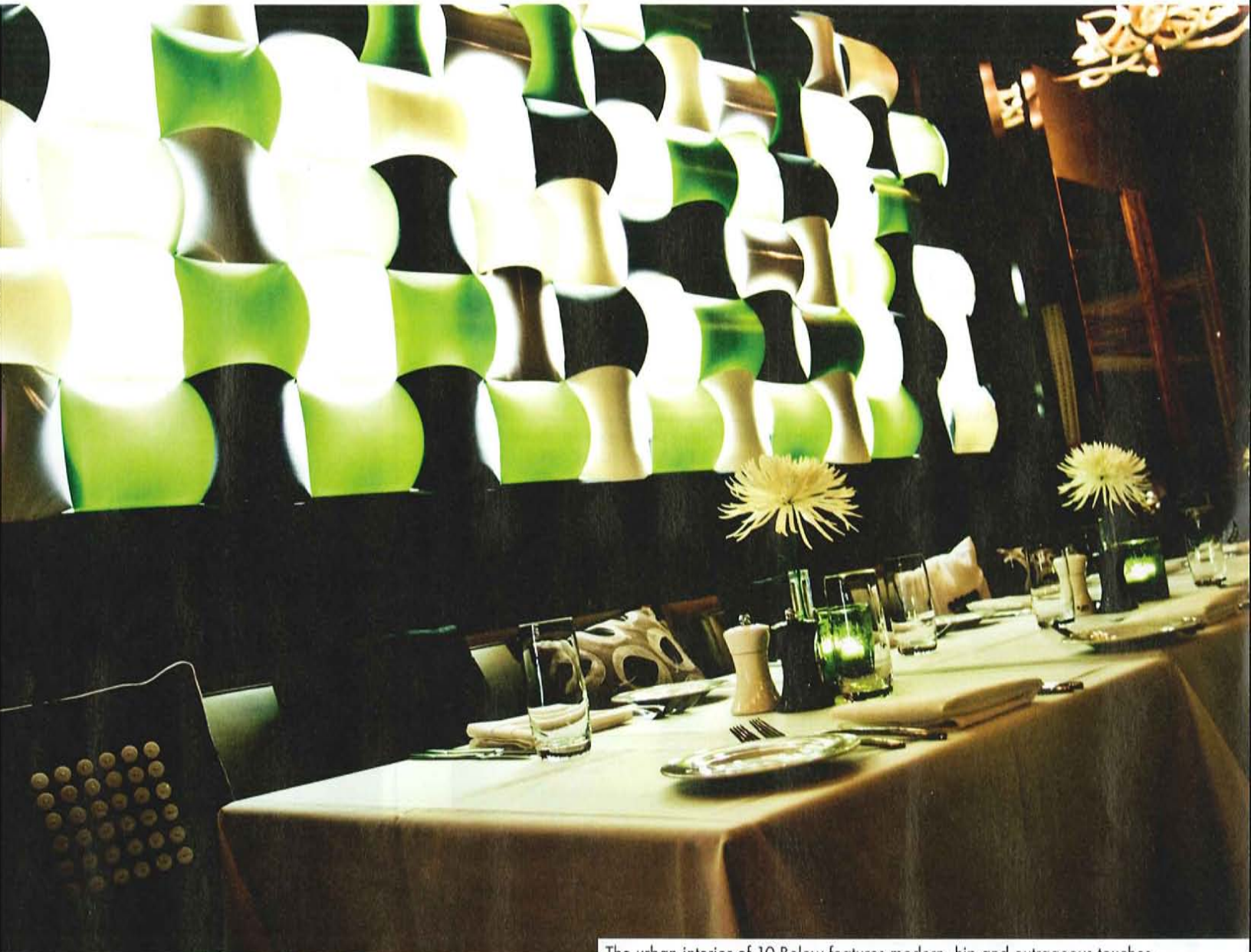
The urban interior of 10 Below features modern, hip and outrageous touches.