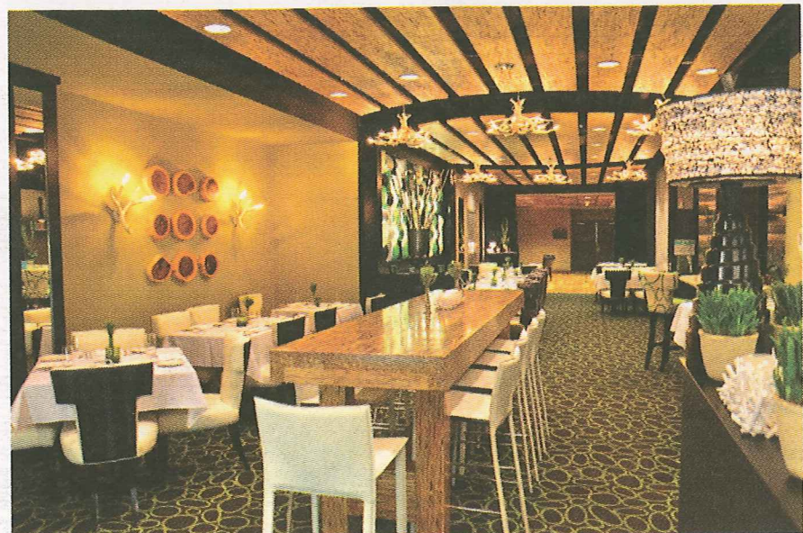
10 Below Dining Room