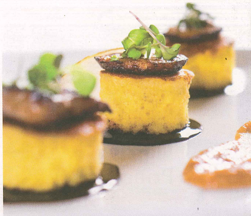
Foie Gras on Brioche French Toast

ly," I answered before reluctantly handing it over. Note to self: definitely no sharing next time.